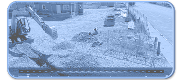
Continuous Video Recording