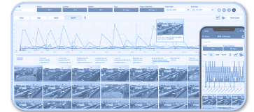
AI Media Dashboard