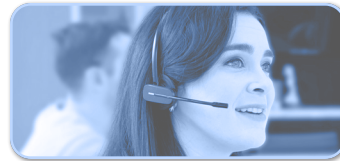
Full Service Support