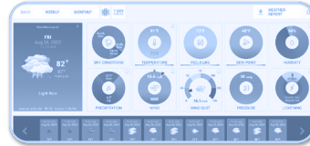
Current and Historical Weather Data