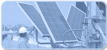
Installation and Maintenance