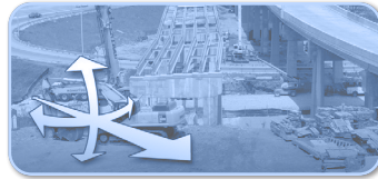
360° User Controllable