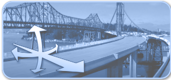
Live Video 360° User Controllable