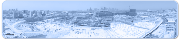
Daily Auto-generated Panoramas