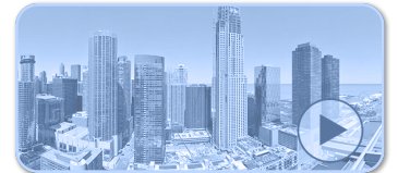
AI-Edited Time-Lapse Videos