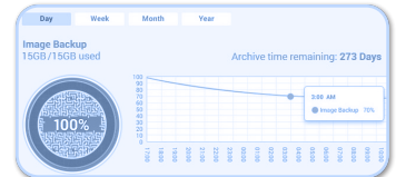
Fail Safe On-Board Backup Storage