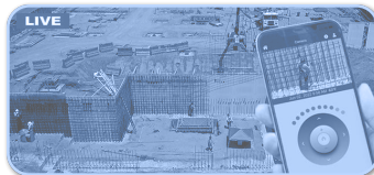
iOS and Android App