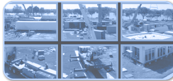
Multiple Preset Archiving