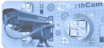
Quality Control and Maintenance