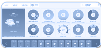
Current and Historical Weather Data