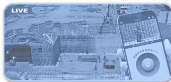
iOS and Android App