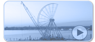
AI-Edited Time-Lapse Videos