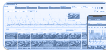
AI Media Dashboard