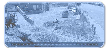
Continuous Video Recording