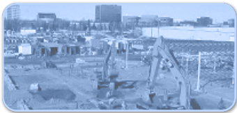
Live Streaming Video

Specification includes camera system and managed services