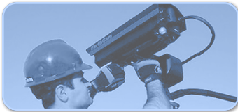
Installation and Maintenance